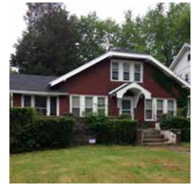
YOUNGSTOWN NEIGHBORHOOD DEVELOPMENT CORPORATION