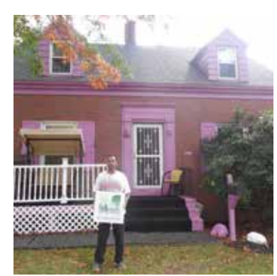
YOUNGSTOWN NEIGHBORHOOD DEVELOPMENT CORPORATION