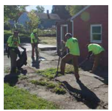
YOUNGSTOWN NEIGHBORHOOD DEVELOPMENT CORPORATION • PERFORMANCE REPORT • PAGE 8