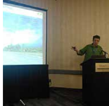
YOUNGSTOWN NEIGHBORHOOD DEVELOPMENT CORPORATION